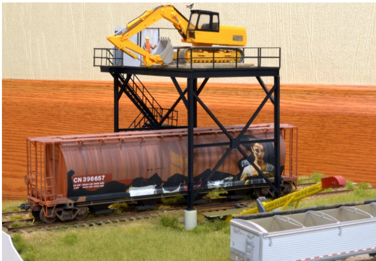
Scratch-built structure by Jon Greggs from prototype action was very interesting.