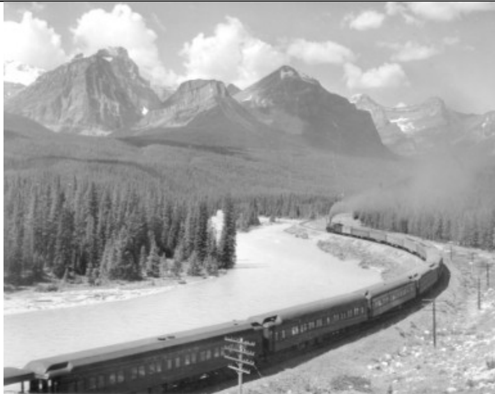
No. 13, the Mountaineer at Mile 113 Laggan Sub c1952