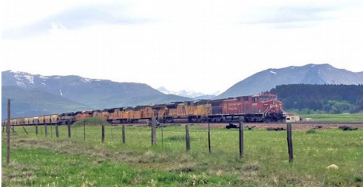
Multiple unit lash-up in the Crowsnest, CP unit in lead, 5 UP's & 2 BNSF, and a rare Dash 7.

Newsletter of The Calgary Model Railway Society