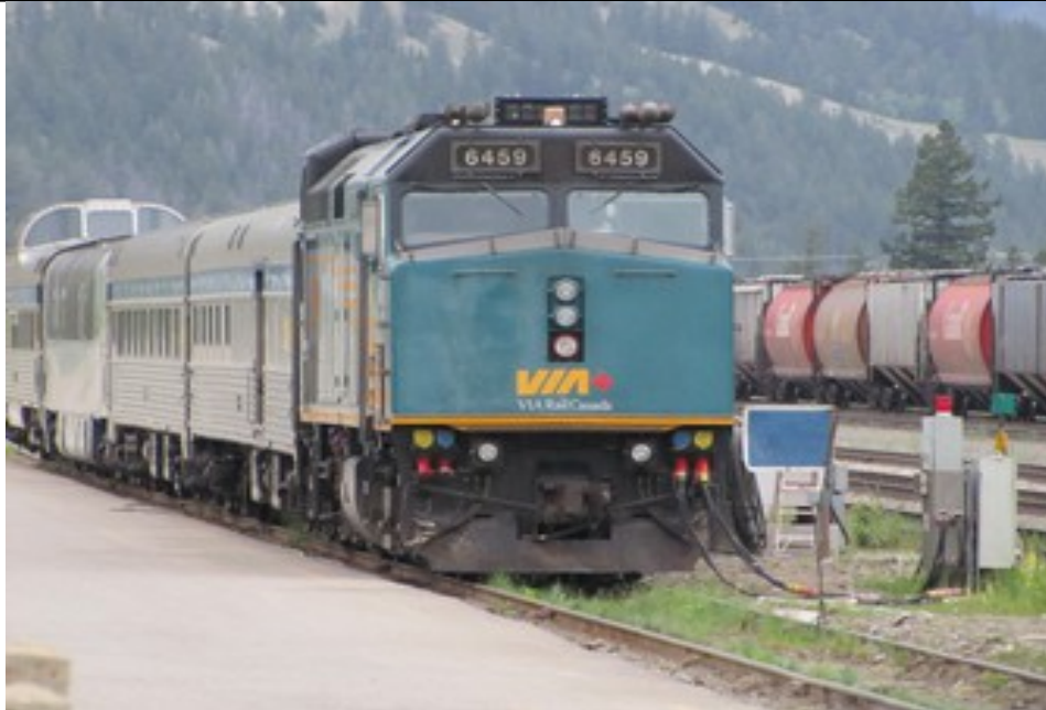
Via Rail 6459 plugged in and awaiting departure at Jasper