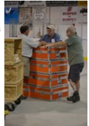
Coffins (and undertakers) come in all forms . . . Some of our US visitors

Much planning was required - not just the setup design, but for the publicity, applications, registration, setup, operating, catering, and a myriad of other details. The layout was designed to allow efficient setup - a core joining two junctions and thus four subdivisions. After the core was set up on the first day, four independent teams set up the subdivisions in parallel. The running and switching opportunities were immense. Three hours running were almost enough to cover all the modules.