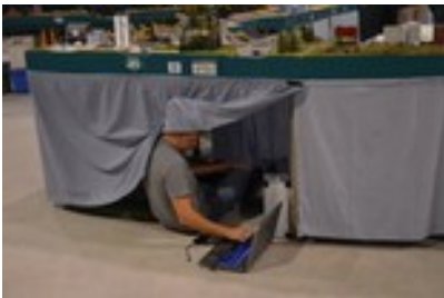
Thar be gremlins here . . .

At night the train lengths were unlimited, and there were several 100 car trains. The evening operating session allowed running with purpose, as on the real railroad. A number of participants took advantage of the 1:1 Ops opportunity to switch real railroad cars with a real GP38. At 16:00 on Sunday it was time to break down. Most layouts were out of the building by 19:30, and participants headed back to their homes satisfied at having been part of a setup that was among the largest, if not the absolute largest, HO Free-mo setup in North America.