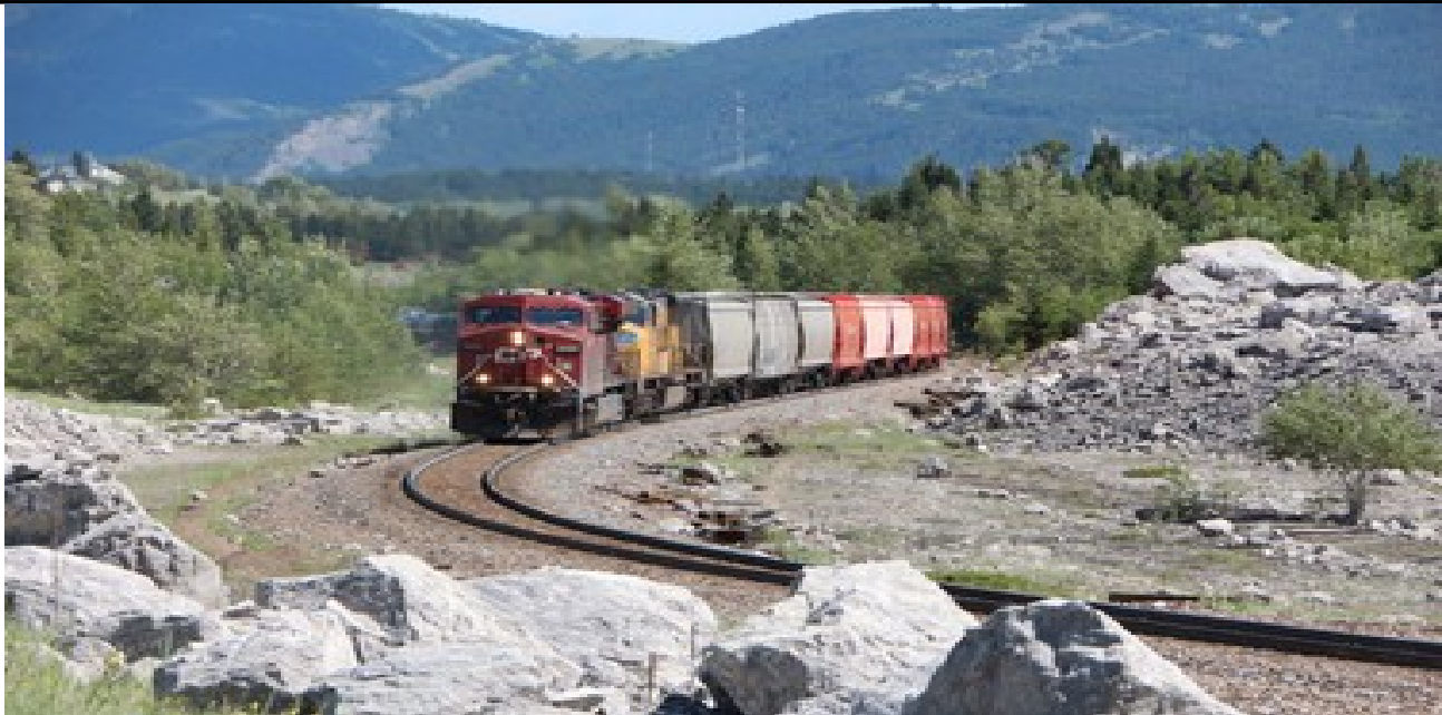
CP 8803 leads a mixed freight approaching the Frank Slide on June 22, 2018. The train is struggling up the steepest grade on the Crowsnest line..