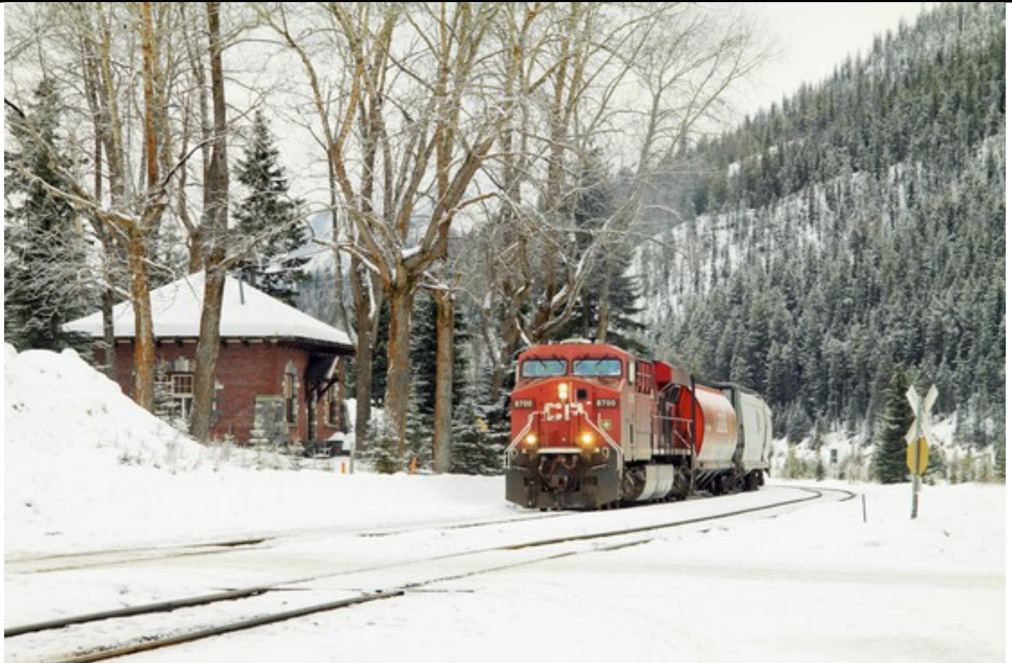
Eastbound train leaving Field just about to start the steep grade up the Big Hill.

Newsletter of The Calgary Model Railway Society