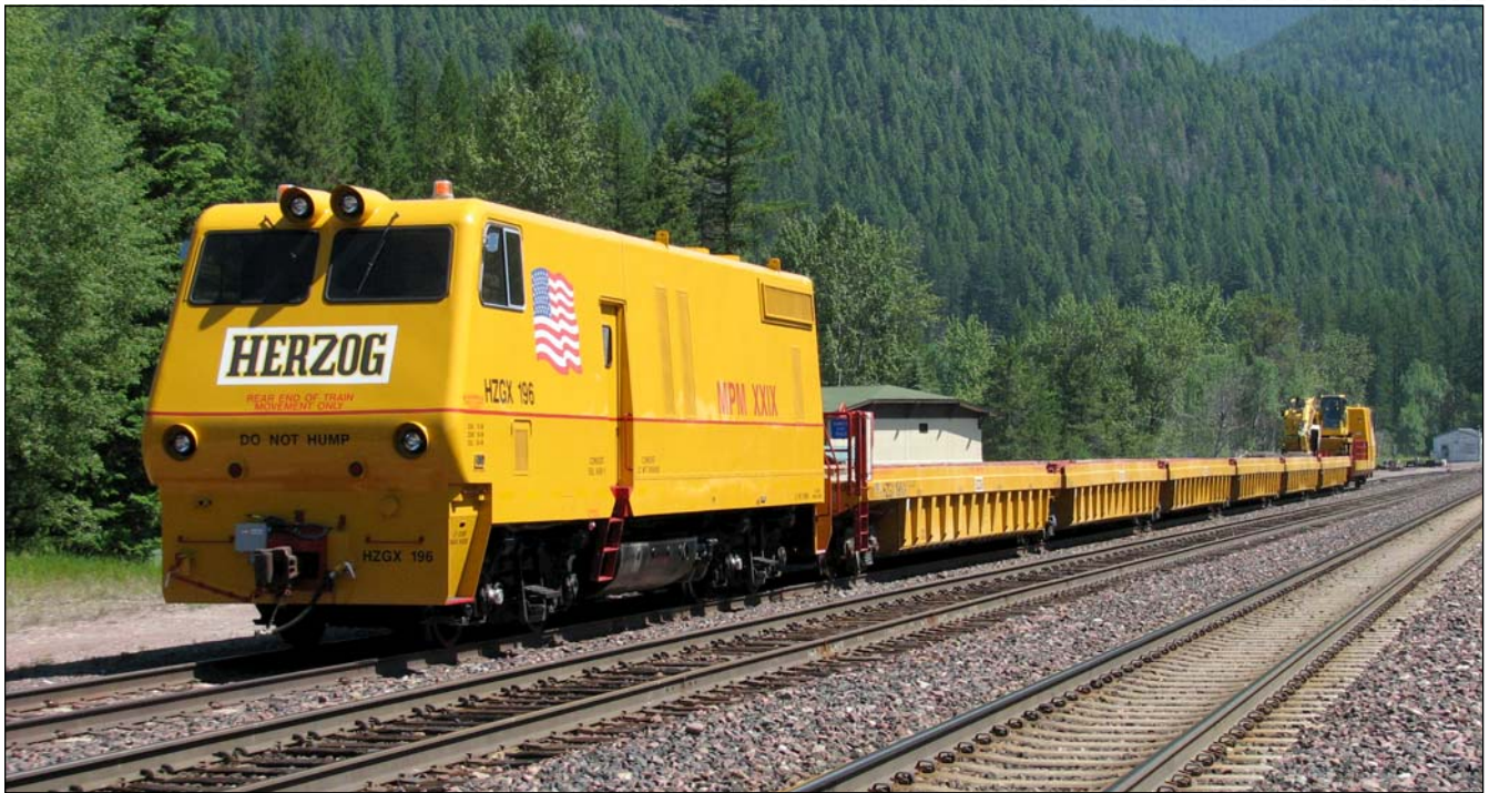
A rather odd looking consist, spotted on one of the back tracks at Belton / West Glacier, Montana earlier this summer. The well cars do not hold containers, rather ballast is stored and scooped out by a backhoe which runs on the side rails all the way down the train. A modified GP40 pulls or pushes the train to where it's needed.

NEWSLETTER FOR THE CALGARY MODEL RAILWAY SOCIETY