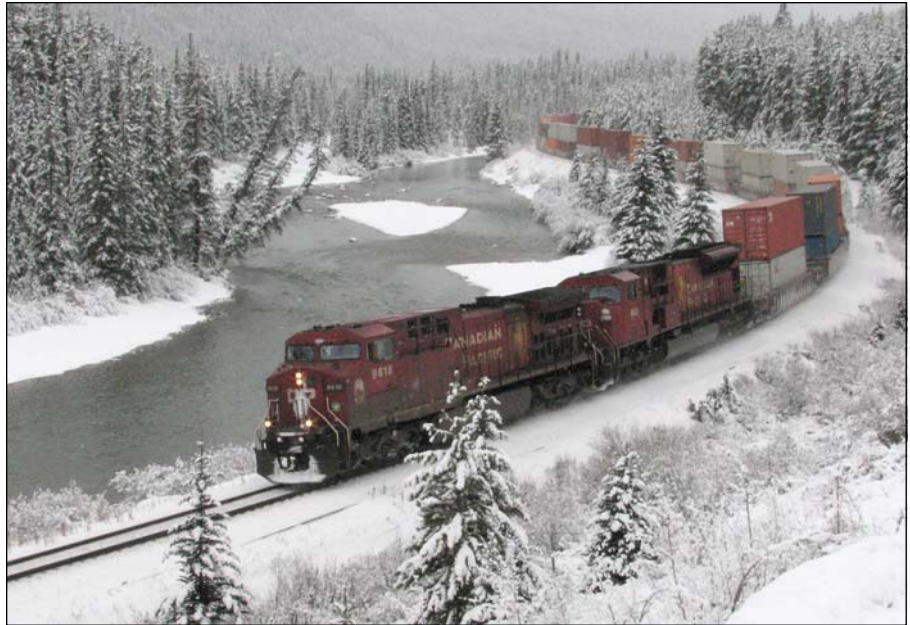
CP 9618 leads an eastbound intermodal freight at Morant's Curve on a picturesque winter day in November of 2006.