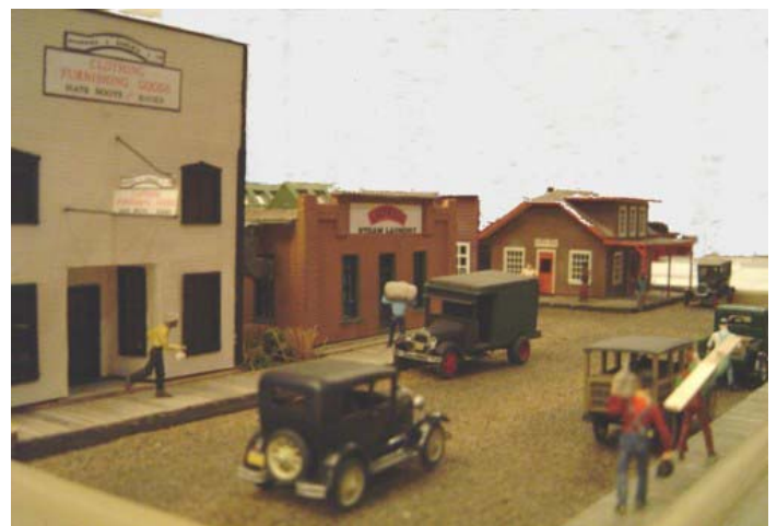
The Empress Steam Laundry by Al Crance.