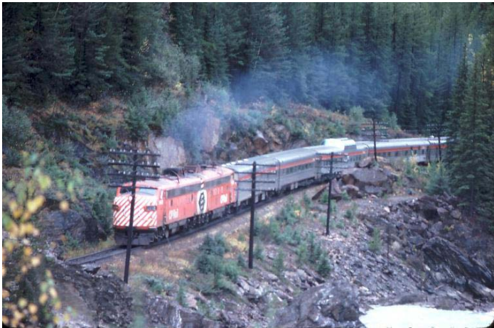
Field, BC Top - 1975 Bottom - 1987