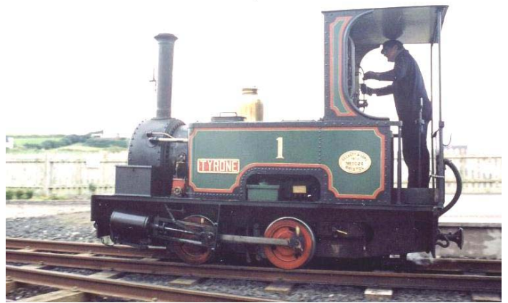
The Giant's Causeway and Bushmills Railway in Northern Ireland. Steamer 'Tyrone' was built by Peckett & Sons in 1904 at Bristol.