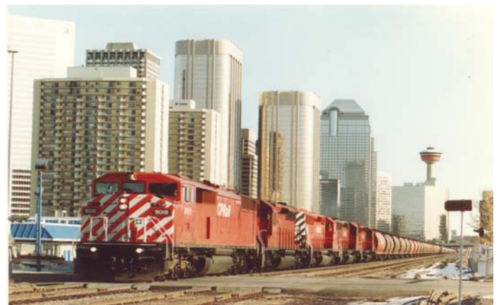
11 th Street 1991 (top) and in 2002 (bottom)