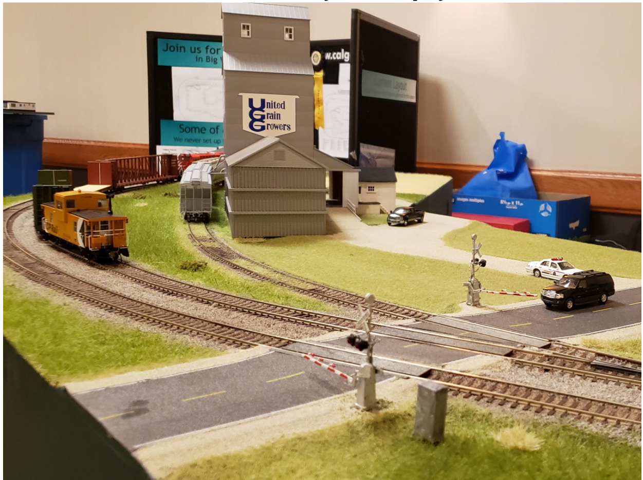
Calgary Free Mo display at CMRS Spring Meet Nicely done with crossing arms, static grass, roadways, grain elevator, and of course a train!