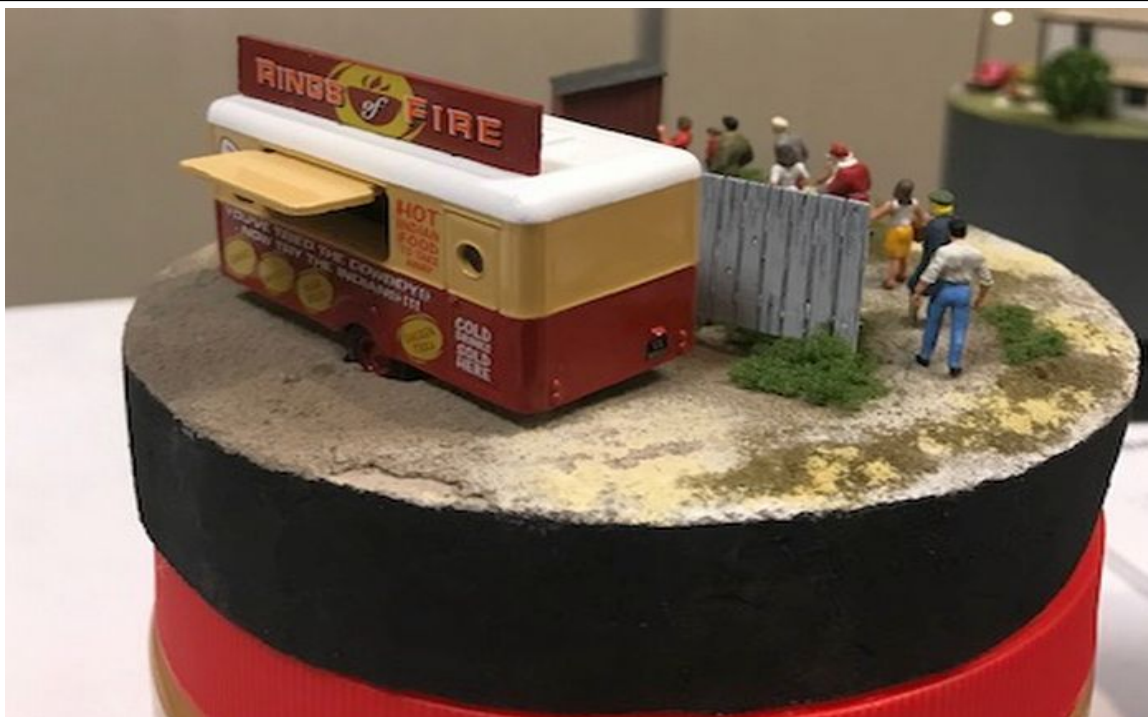
Rings of Fire Restaurant had people lined up at the CMRS Lid Challenge. Nice detail work by Dale Sproule.