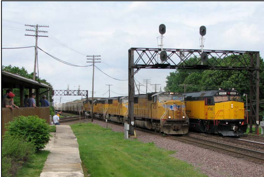
The double-track diamonds at Rochelle, Illinois are occupied by a UP freight and a Harsco Rail Change-out Train in June 2008. Carl Van Veen shared some great locations to railfan around Chicago at this past Slide Night.