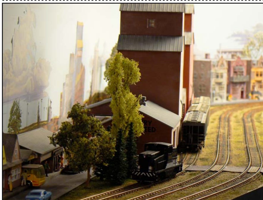
Claresholm Siding sees some activity on Ed Hopkin's "Elbonia Central" layout, participating in this year's Layout Tours. Ed's HO scale double-deck layout features 21 towns and has plenty of new features for 2009.