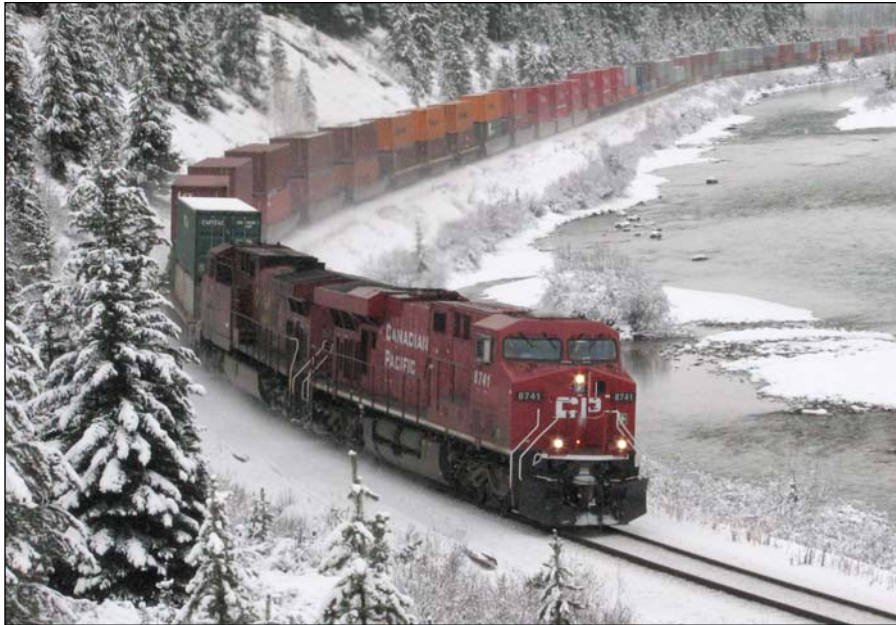
CP 8741 leads a westbound intermodal freight at Morant's Curve on a picturesque winter day in November of 2006.

NEWSLETTER FOR THE CALGARY MODEL RAILWAY SOCIETY